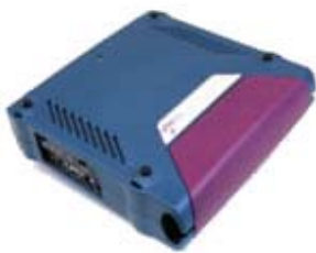
FRONTDAQ FD20 ::

20 synchronous channels with up to 7480 samples/second/channel. Webserver